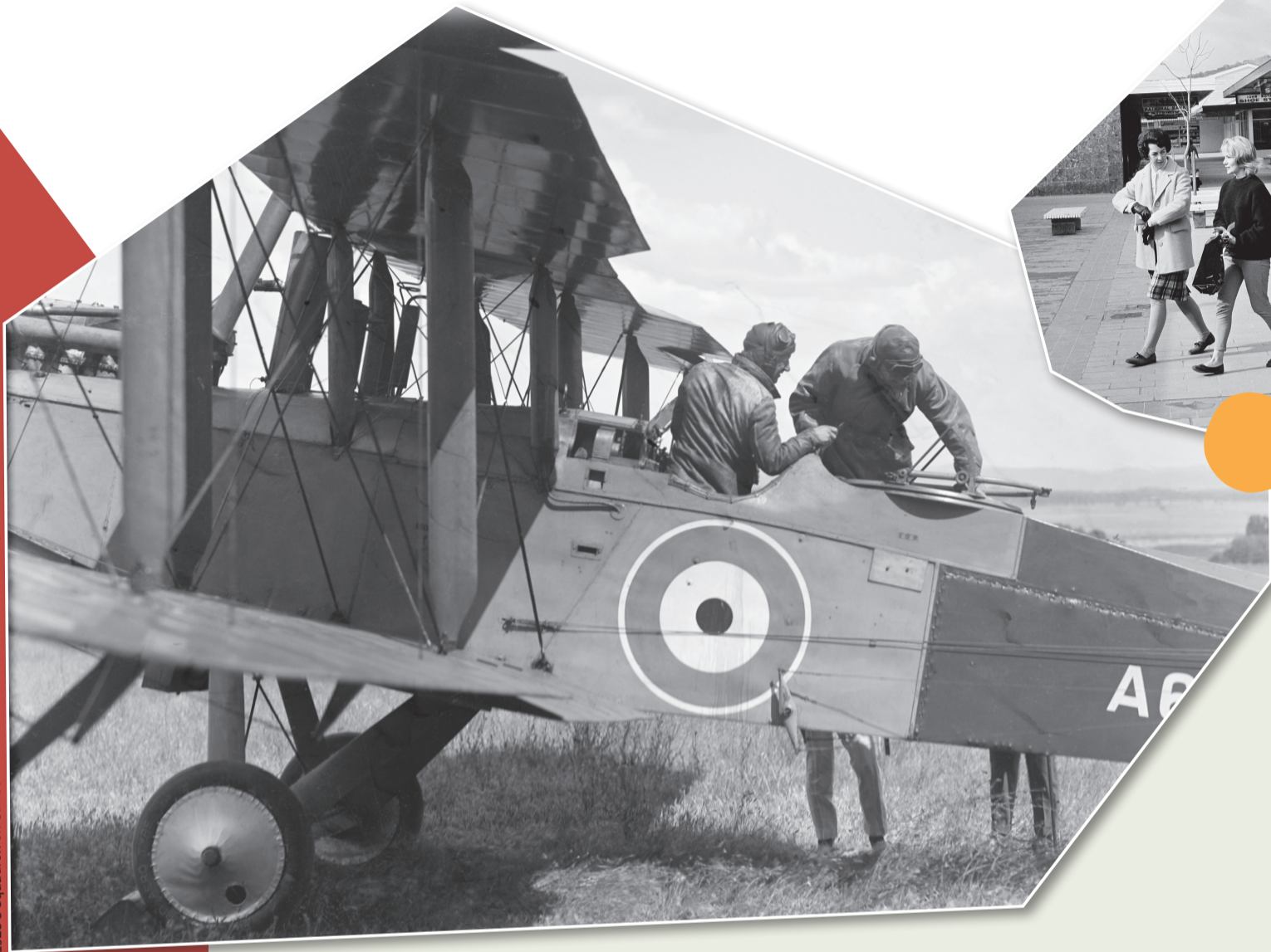
1925 3 Squadron on Canberra Aerodrome at Dickson NAA: A3560, 1526